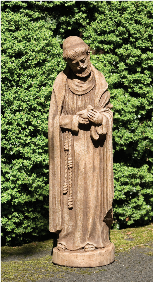
Shown in Brownstone