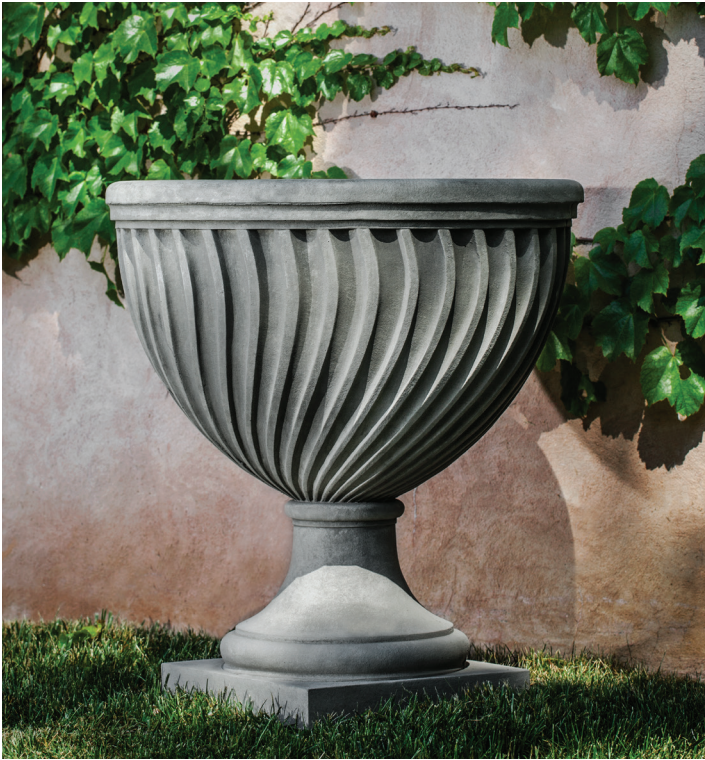
Shown in Alpine Stone