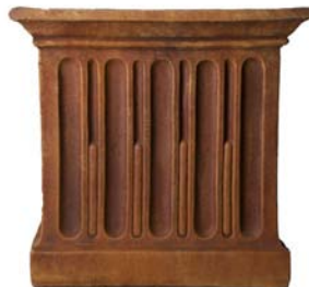
Ferro Rustico (FR)*