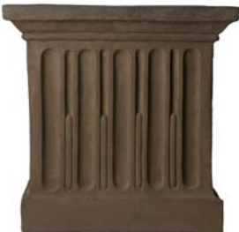
Pietra Vecchia (PV)*