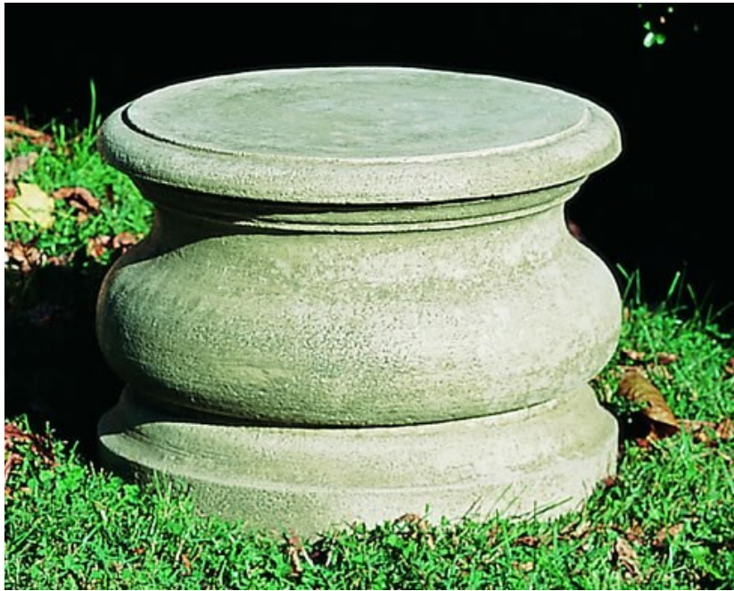
LOW ROUND PLAIN PEDESTAL