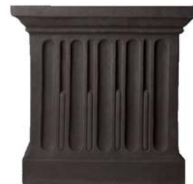
Terra Nera (TN)*