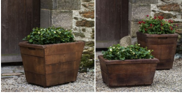
Shown in: Pietra Vecchia (PV)