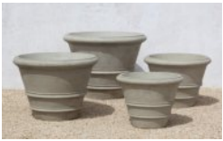
Shown in: Verde (VE)