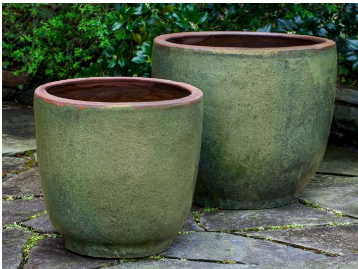
Shown in Rustic Green