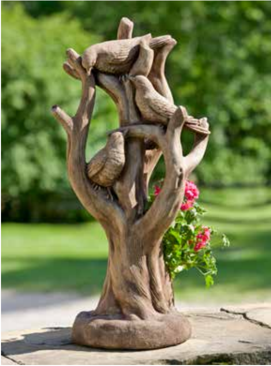
Shown in Brownstone