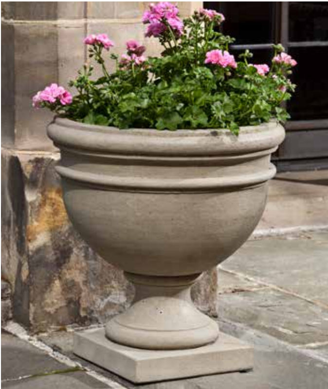
Shown in Verde