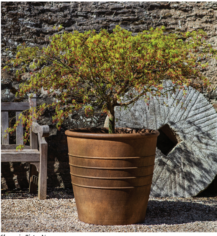
Shown in Pietra Nuova