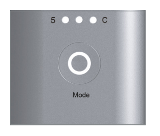
10. Power/Mode Button