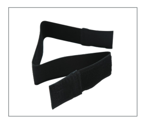
9. Velcro Strap