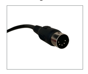
7. 5 Pin Plug