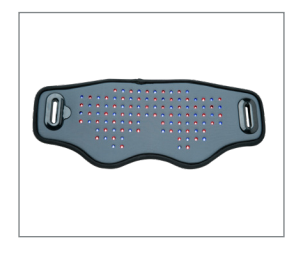
LSF 104 Face Pad