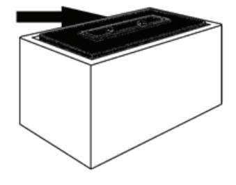
FT-323A (35 lbs) 24"L x 12"W x 2"H