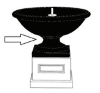
FT282D (151 lbs) 29.5"W x 17"H

Step 1 - Place the base (FT-282E) into position where the fountain will be installed, ensuring that it is level.