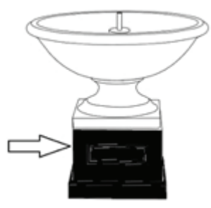
FT-282E (96 lbs) 16"L x 16"W x 12"H

Two people are recommended for the installation of this fountain!