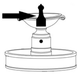
FT-224A (6 lbs) 5.25"W x 10.5"H

12. Fit the pipe protruding from the top of the top bowl (FT-224B) into the hole in the bottom of the finial (FT-224A).