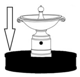
FT-224F (229 lbs) 41.5"L x 34.5"W x 9.5"H

Assemble your fountain on a level surface capable of holding a minimum of 500 pounds with an approximate 9 square foot footprint.