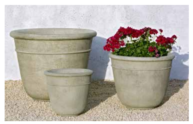
Shown in Verde