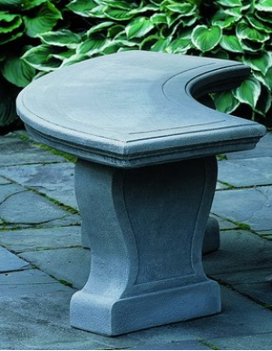
Shown in (GS)