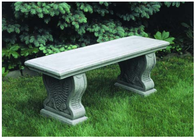
WOODLAND FERNS BENCH