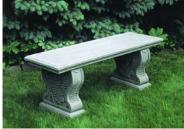
Shown in (GS)