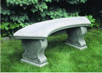
Shown in (GS)