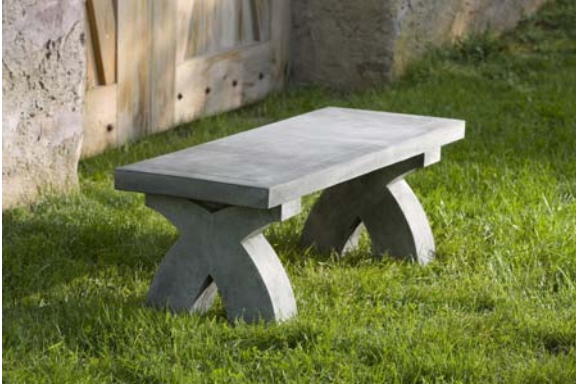
Shown in (AS)