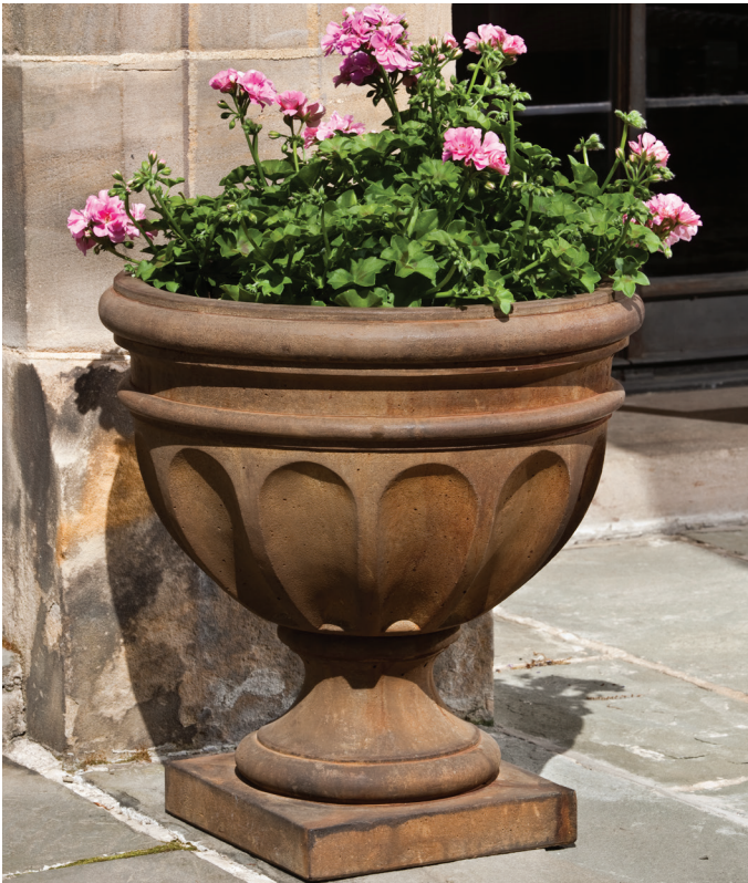
Shown in Pietra Nuova