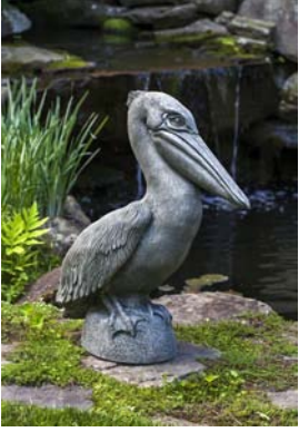
Shown in (AS)