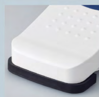
Foot Switch Stopper