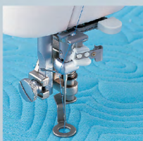
1/4" Quilting Foot