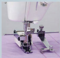
Quilt Guide for Upper Feed Presser Foot