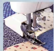
Upper Feed Presser Foot