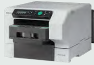
The RICOH Ri 100 is highly compact, portable, and easy to use