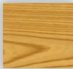
NORTH AMERICAN OAK