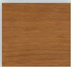
ASIAN GOLDEN TEAK