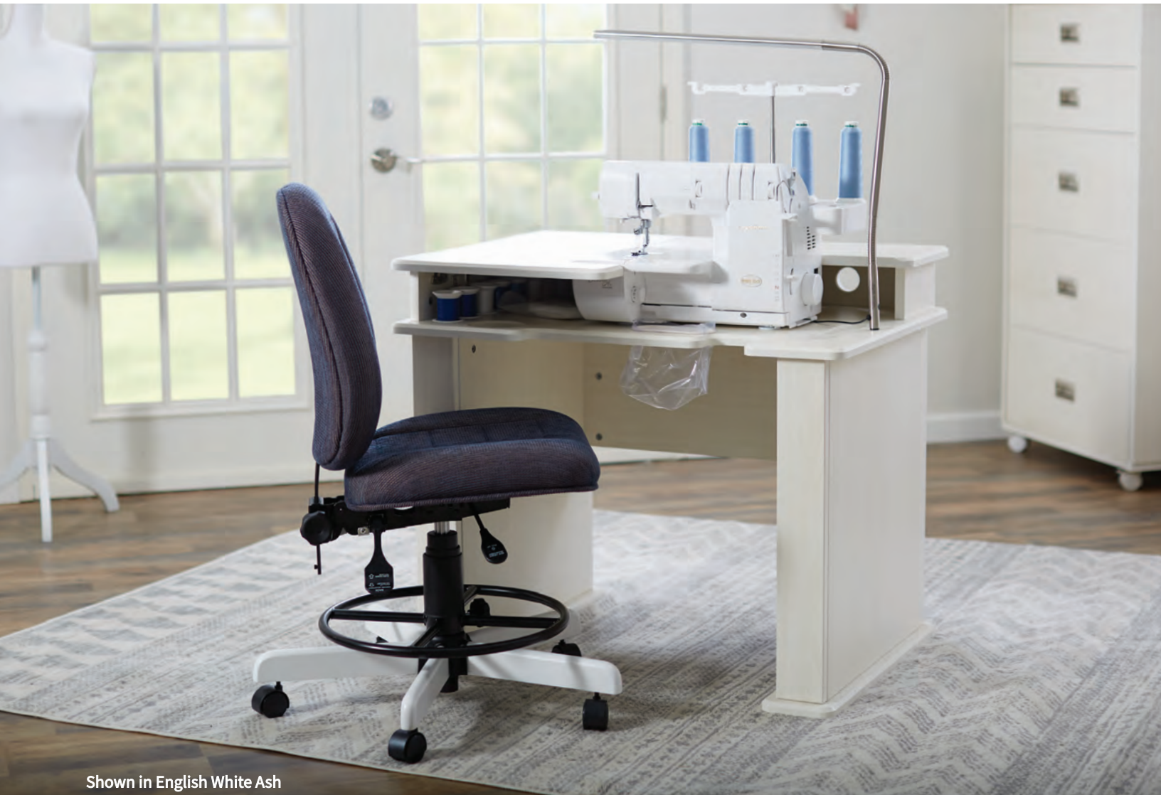
Shown in English White Ash