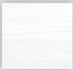
ENGLISH WHITE ASH

Different Baby Lock Sergers require modifications to the Serger Center. Note your machine model when ordering.