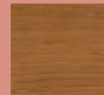
ASIAN GOLDEN TEAK