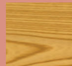
NORTH AMERICAN OAK