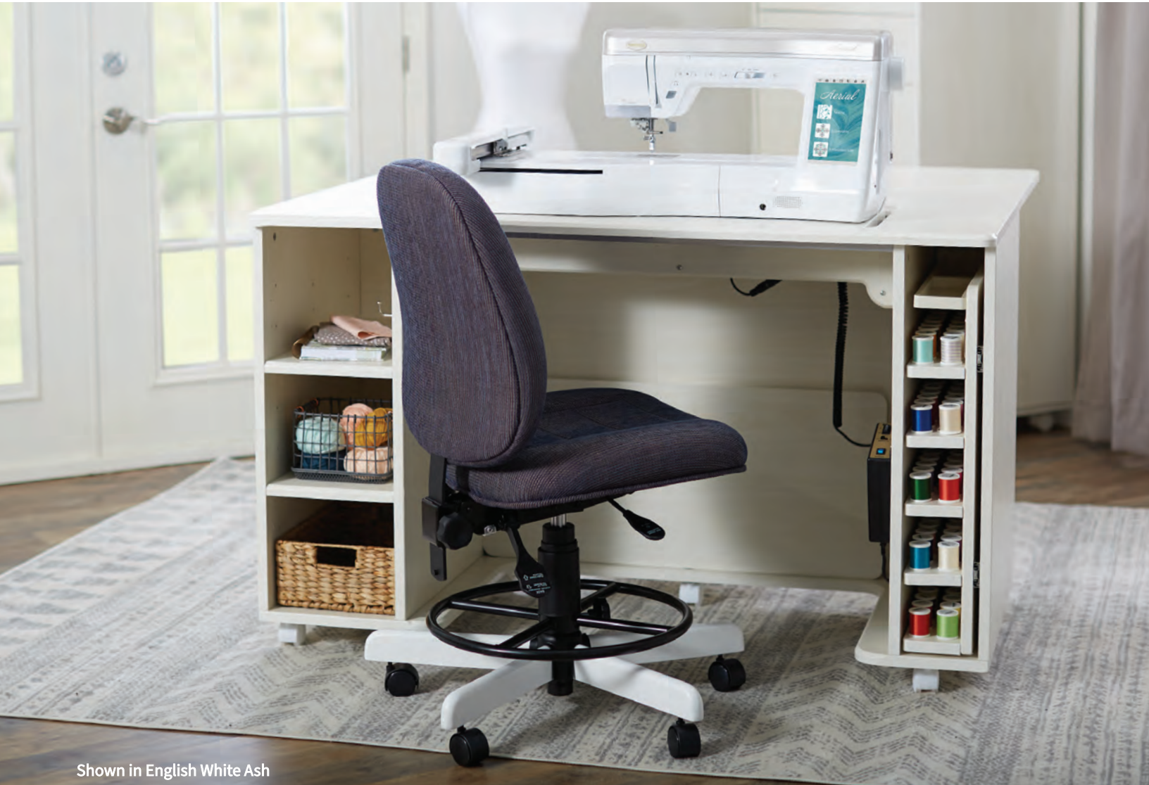
Shown in English White Ash