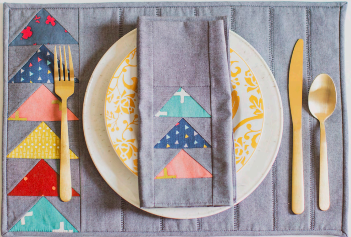
Chris Tryon • "Flying Geese for Supper"