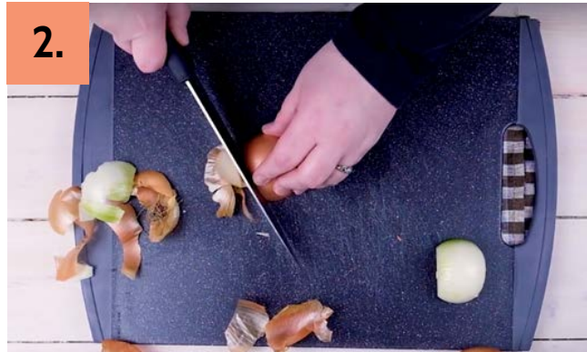
2. Chop both ends off the onion so it lays flat, then peel.