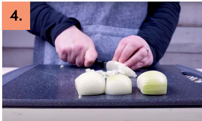
4. Rotate it and cut in vertically again.