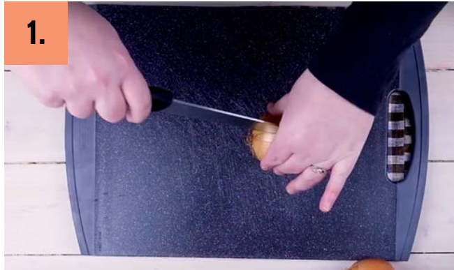
1. Cut the onion in half.

Follow this step by step guide on how to safely dice an onion.