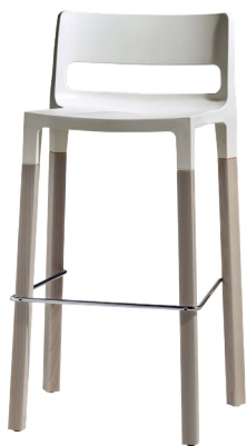
2818 FS 11