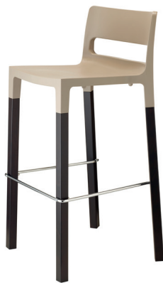
2818 FW 15

Seduta in tecnopolimero riciclabile rinforzato fibra di vetro. Gambe in faggio da mm 35x35. Poggiapiedi in acciaio cromato. Per uso interno. Impilabile.