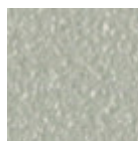
Light Grey Steel