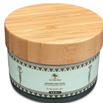
DECADENT MINT CACAO