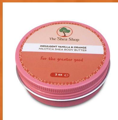
INDULGENT VANILLA & ORANGE

Moisturize, condition & indulge your skin with our East African signature Nilotica Shea Butter. Restorative powers of rich vitamins A & E and phytonutrients. Our signature blend is fortified with 5 skin-moisturizing fatty acids plus minerals & vitamins A, E, F and K. Our Organic Ugandan Shea Butter moisturizes, replenishes & nourishes your skin giving it vibrancy and youthfulness daily.