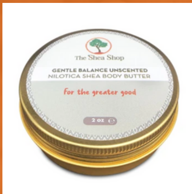
GENTLE BALANCE UNSCENTED