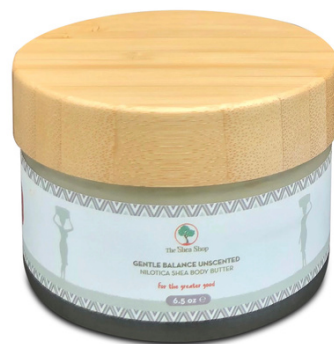
GENTLE BALANCE UNSCENTED