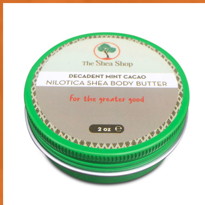
DECADENT MINT CACAO