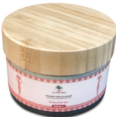
INDULGENT VANILLA & ORANGE