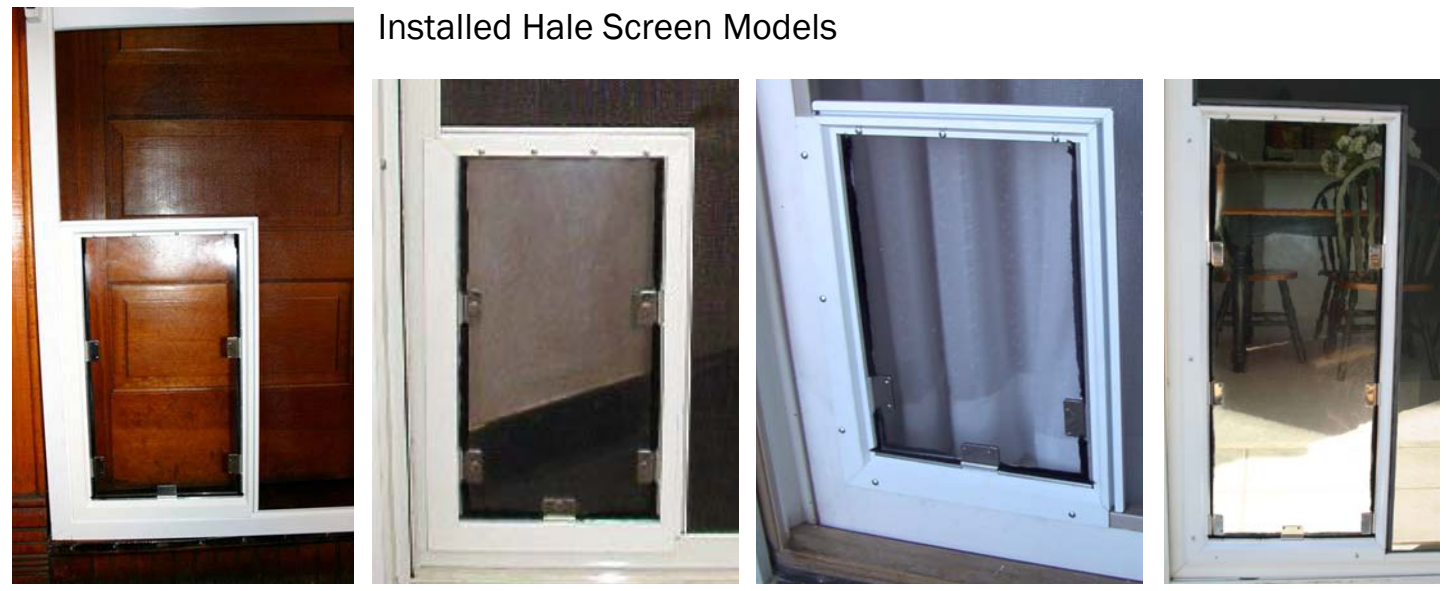
Above two units factory modified and screwed into door frame from outside.