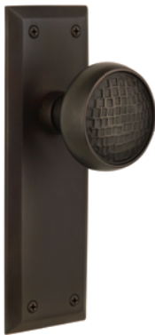
NYKCRA-OB New York with Craftsman knob in Oil-Rubbed Bronze