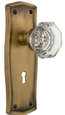
PRAWAL-AB Prairie with Waldorf knob in Antique Brass