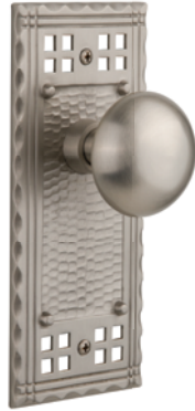
CRANYK-SN Craftsman with New York knob in Satin Nickel