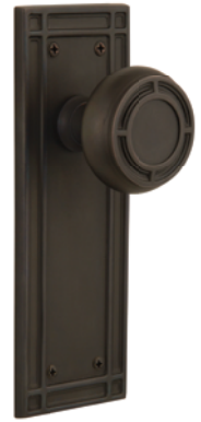
MISMIS-OB Mission with Mission knob in Oil-Rubbed Bronze