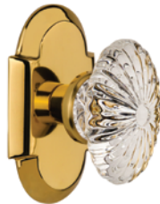
COTOFC-PB Cottage with Oval Fluted Crystal knob in Polished Brass