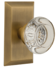
STURCC-AB Studio with Round Clear Crystal knob in Antique Brass