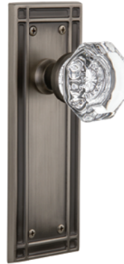
MISWAL-AP Mission with Waldorf knob in Antique Pewter