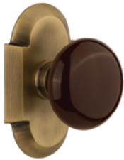
COTBRN-AB Cottage with Brown Porcelain knob in Antique Brass