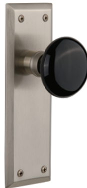
NYKBLK-SN New York with Black Porcelain knob in Satin Nickel