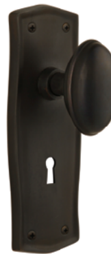
PRAHOM-OB Prairie with Homestead knob in Oil-Rubbed Bronze