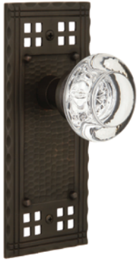
CRARCC-OB Craftsman with Round Clear Crystal knob in Oil-Rubbed Bronze