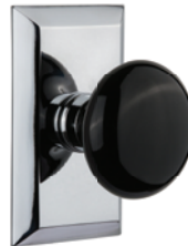
STUBLK-BC Studio with Black Porcelain knob in Bright Chrome