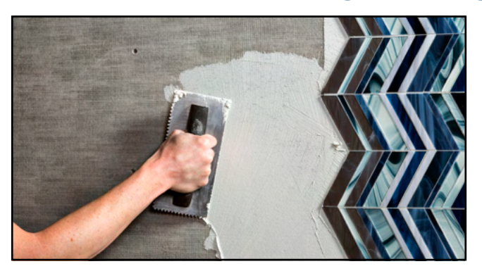
Step 1 To initiate the bond coat, use the flat side of a trowel and firmly apply thin-set to the substrate.