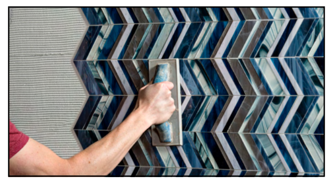
Step 4 To achieve the flattest possible surface, lightly tap the sheets with a rubber grout float. Pay particular attention to the sheet-to-sheet intersections.