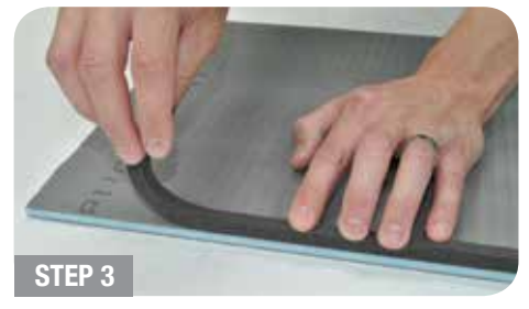
Cut another piece of cement board that is larger than a sheet of mosaics. Apply a strip of self-adhesive foam weather-strip to one edge of the cement board.