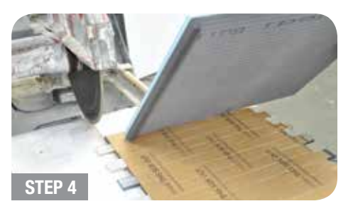
With the saw turned off, place the mosaic sheet, paper side up, on the cement board covered saw tray and align the cut.