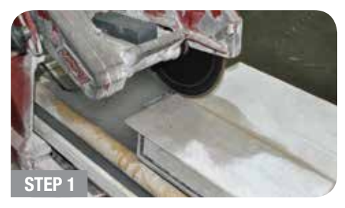
Cover the saw tray with a piece of cement board. This provides continuous support for the sheet and prevents pieces from falling into the tray's cutting channel.

The cutting process detailed below can be used with face-mounted mosaics to fully support the tile, reduce chipping and protect the mounting system from saw overspray. To watch a video of the process, click here.