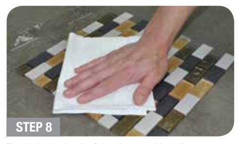
Towel dry the back of the sheet and install as normal.