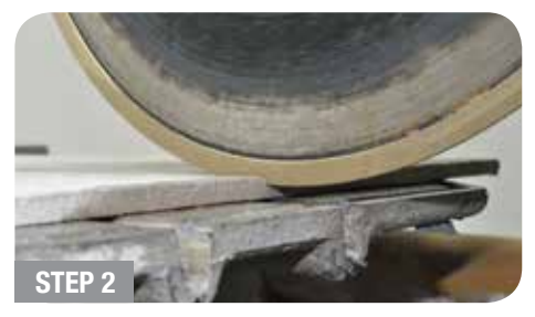
Adjust the blade height so the blade cuts through half of the cement board thickness.