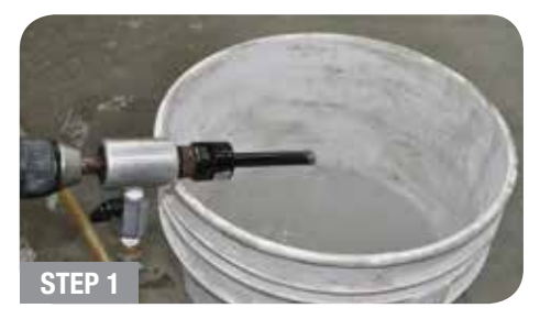
Attach a water swivel (central water feed) and diamond core bit to the drill (or use a spray bottle). Connect the water swivel to a water source and adjust the water flow to a slow trickle. Slow water flow will reducing chipping by cooling and lubricating the drill bit.

Oceanside Glass & Tile products can be drilled using a diamond core bit designed for drilling dense materials (e.g. glass or granite). Use sufficient water to keep the bit cool and lubricated during drilling. The diameter of all drilled holes must be large enough to allow a fastener to pass through the tile and substrate without making contact. Solid blocking for the anchoring of fixtures, such as shower doors and towel bars, must be installed prior to installing the tile substrate.