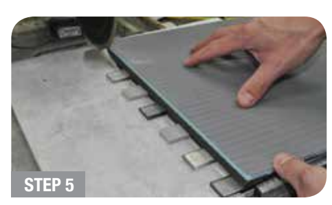
Place the second piece of cement board on top of the mosaic sheet. Cover the portion of the sheet that is to be installed (keeper) with the weather-strip side down and against the blade. The board will protect the sheet from saw overspray.