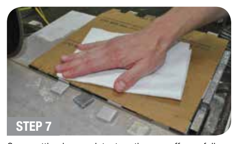
Once cutting is complete, turn the saw off, carefully remove the top layer of cement board and quickly towel dry the mounting paper.