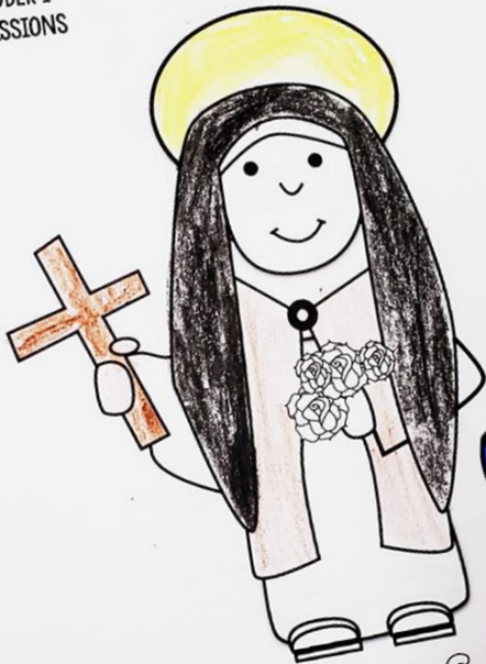
St. Therese of Lisieux

After becoming ill, St. Therese prayed to Our Mother Mary and was healed. She devoted her life to helping priests and sacrificing for others. She reminds us that we can all do little things for God's kingdom.