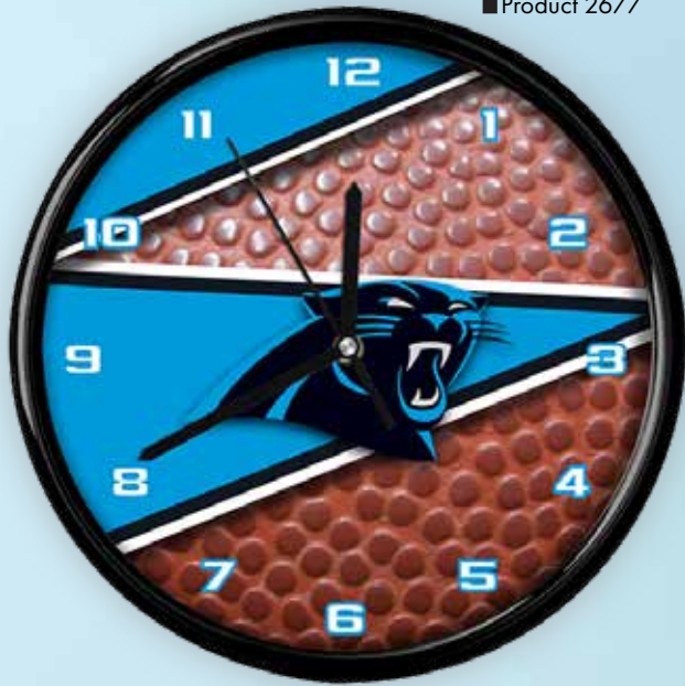
12" BALL CLOCK ■ Product 2677