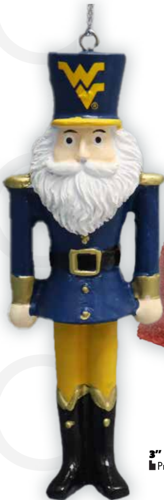
3" NUTCRACKER ORNAMENT ■ Product 2966