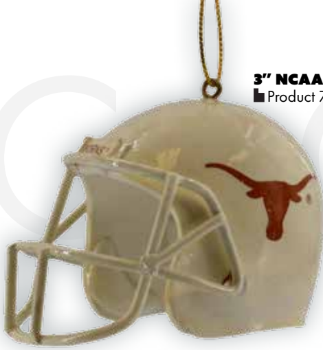
3" NCAA HELMET ORNAMENT ■ Product 771