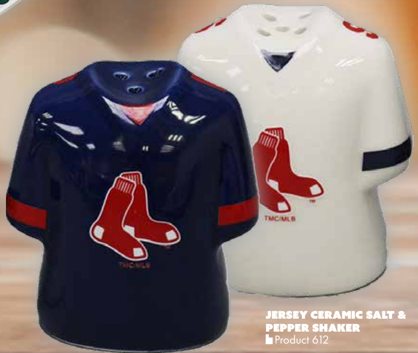
JERSEY CERAMIC SALT & PEPPER SHAKER Product 612