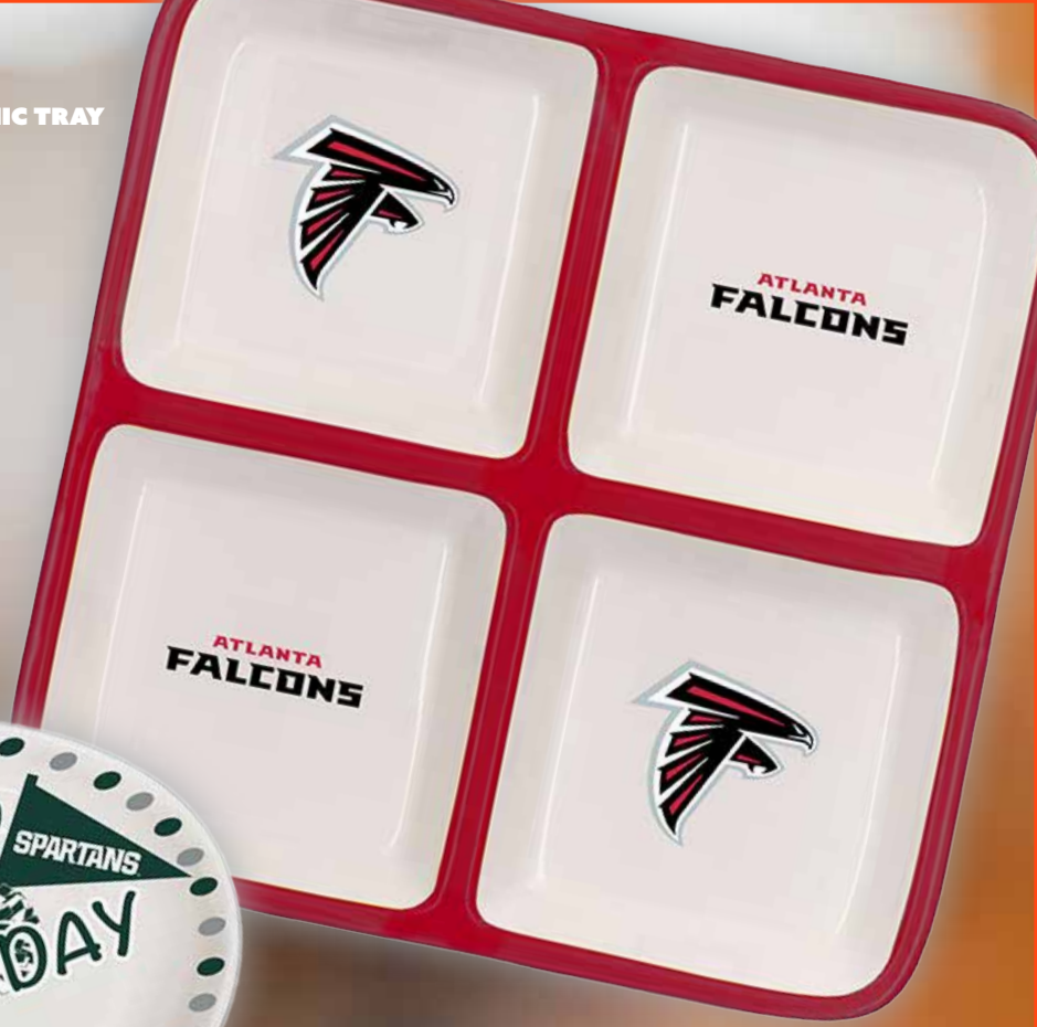
4 SECTION CERAMIC TRAY Product 2408