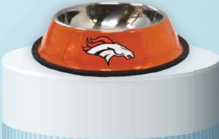
STAINLESS STEEL PET BOWL ■ Product 2954