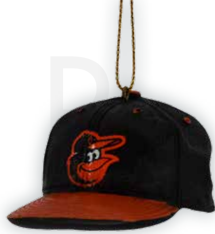
3" BASEBALL CAP ORNAMENT ■ Product 773