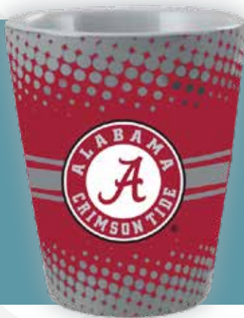
2 OZ FULL WRAP CERAMIC COLLECTOR GLASS