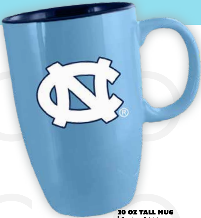
20 OZ TALL MUG ■ Product 2666