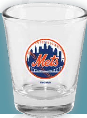
2 OZ SHOT GLASS