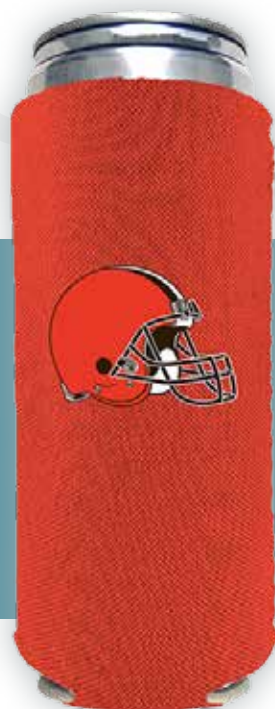
SLIM CAN INSULATOR