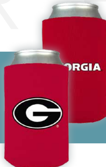
TEAM LOGO CAN INSULATOR