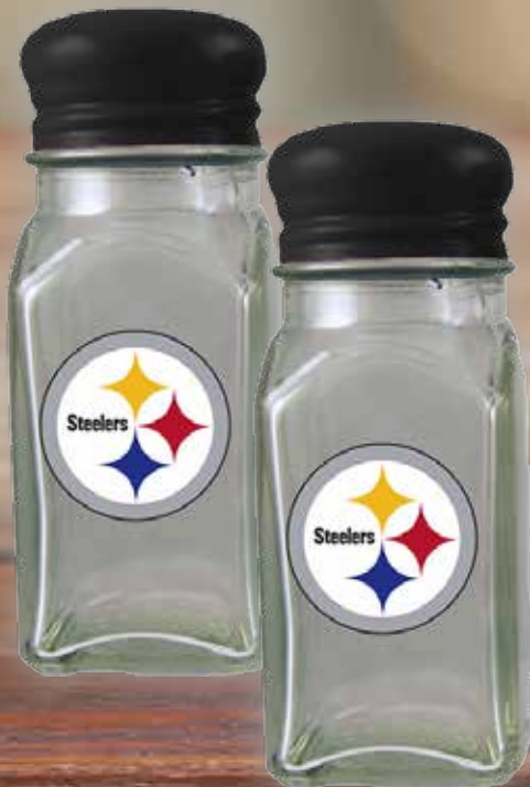
GLASS SALT & PEPPER SHAKERS WITH COLORED LIDS Product 2610