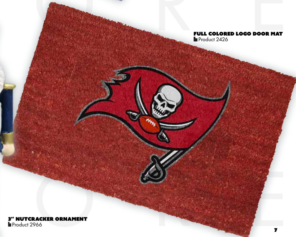
FULL COLORED LOGO DOOR MAT ■ Product 2426