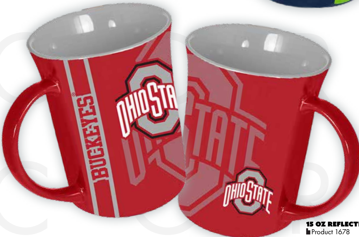
15 OZ REFLECTIVE MUG ■ Product 1678