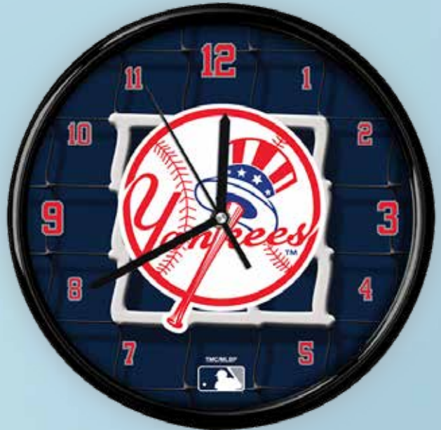
12" TEAM NET CLOCK ■ Product 2676