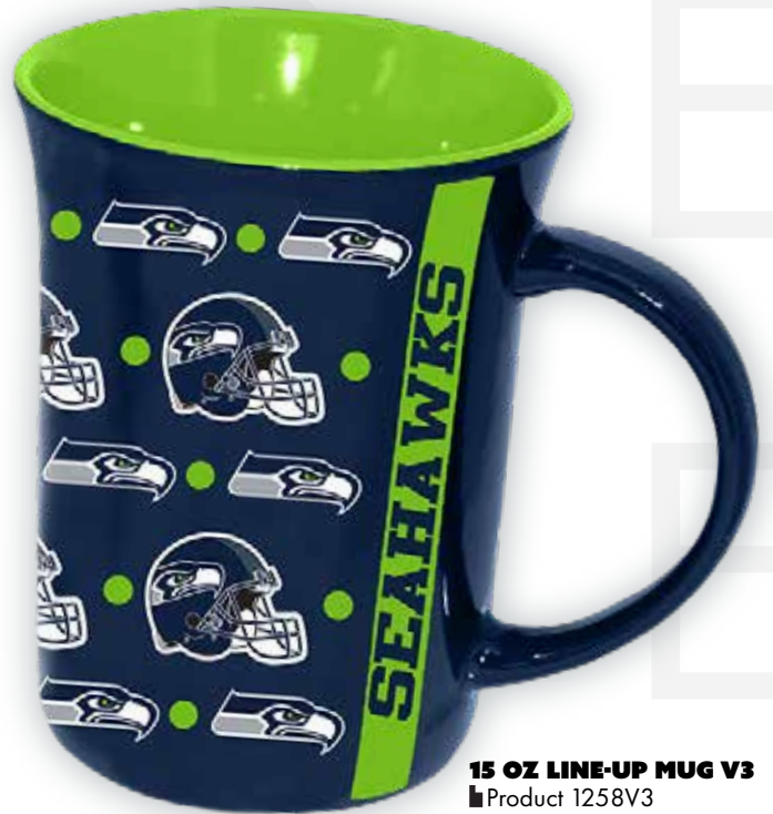
15 OZ LINE-UP MUG V3 ■ Product 1258V3