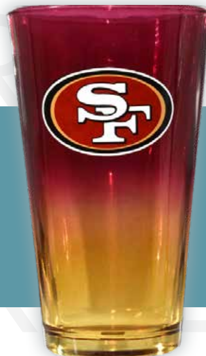
17 OZ OMBRE PINT GLASS