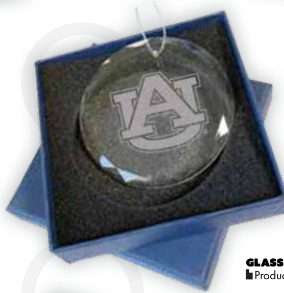
GLASS ORNAMENT ■ Product 3202ETC