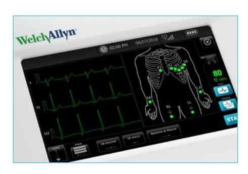
Lead quality display

User-friendly display and interface helps minimize training and save time.