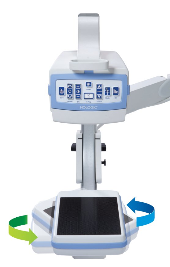
Flat detector rotation is an industry exclusive from Hologic.