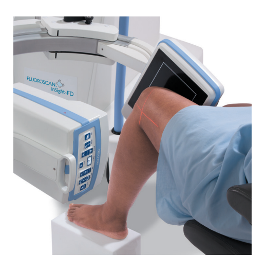
Exclusive rotating detector and user-friendly sterile field controls meet surgeons' needs.