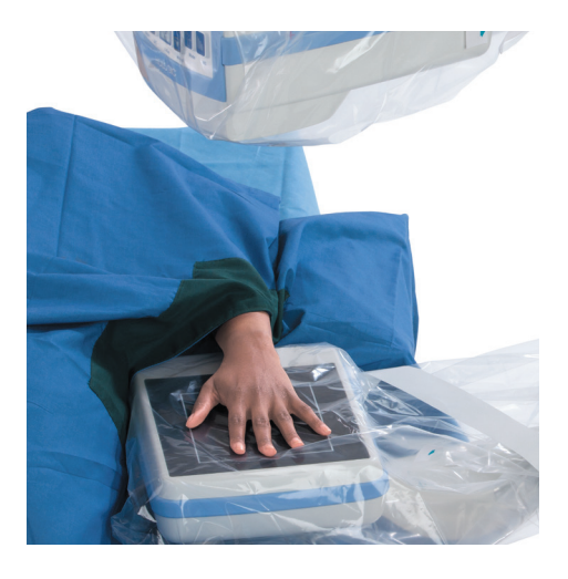
Flat detector sweet spot insures the anatomy of interest is always within the field of view.