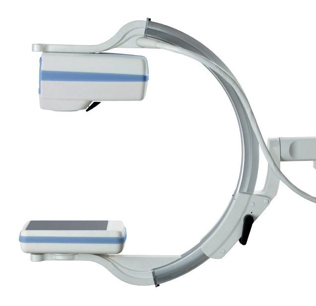
20" (50.6 cm) arch depth & thin profile for table-top positioning.