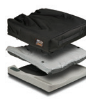
J2™/ J2 DC