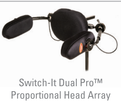
Switch-It Dual Pro™ Proportional Head Array