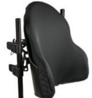
J3™ PD, PDC, PDL