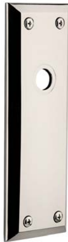
Fifth Avenue Long Plate in Polished Nickel