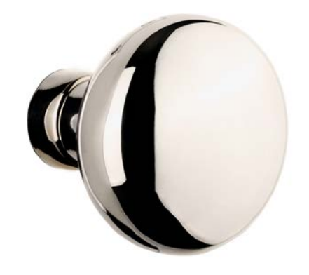
Fifth Avenue Knob in Polished Nickel