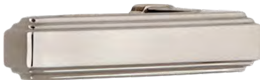
Carré Lever in Polished Nickel

Carré Lever can be combined with any Grandeur rosette, short, long or tall plate.