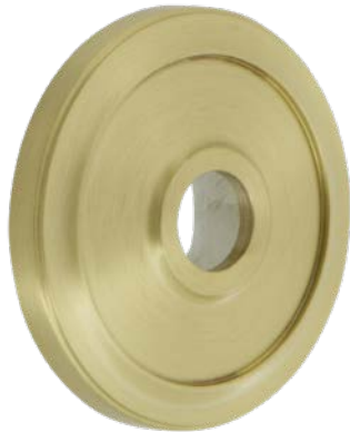
Circulaire Rosette in Satin brass