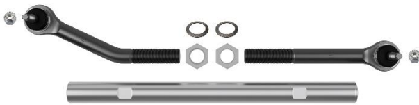
Fig. 1: DRAG LINK