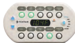
SpaCommand® Spa-Side Remote 10-Function Spa-Side Remote