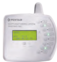
EasyTouch System Wireless Controller