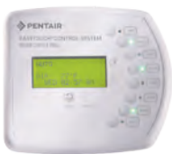
EasyTouch System Indoor Control Panel (4- or 8-Function Control)

EasyTouch systems are available for a separate spa, a separate pool, or a pool/spa combination with shared equipment. You select from systems that control four or eight accessory functions. Four-function systems are typically used to control pool and/or spa operation plus pool or spa lights and heaters. Eight-function systems allow separate scheduling for additional features, such as landscape lighting, waterfalls, fountains, additional heaters and more. Take the work and worry out of scheduling and operating pool and spa heating, filtration and cleaning cycles. For even greater convenience, you can add any of these optional controllers: