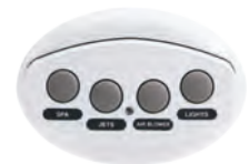
iS4 4-Function Spa-Side Remote