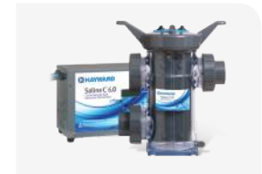
SALINE C SYSTEM

» haywardcommercialpool.com » (301) 838-4001