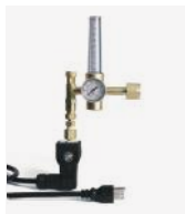
CO 2 FEEDER