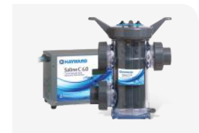
SALINE C® SYSTEM

*Standard Package includes Molded Flow Cell and Float-Style Flow Sensor