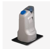
pH/Cl CHEMICAL FEED SYSTEMS