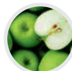
apple / pyrus malus