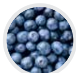
bilberry / vaccinium myrtillus