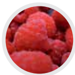
raspberry / rubus idaeus