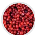
cranberry / vaccinium macrocarpon