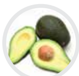
avocado / persea gratissima