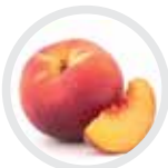
peach / prunus persica