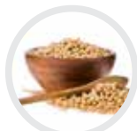
soy / soy amino acids