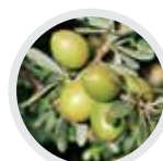
argan / argania spinosa