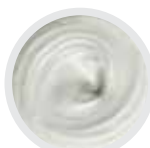
yogurt / yogurt powder