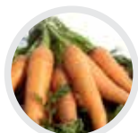
carrot / daucus carota