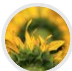
sunflower / helianthus annuus