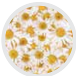
camomile / chamomilla recutita

Amino acid complex* — Soy and wheat derived amino acid complex.