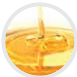
honey / mel

Each active ingredient is selected for its nutritive and lasting aesthetic effect, for weightless hair with maximum vitality and shine.