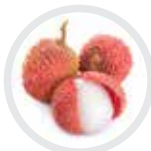
lychee / litchi chinensis