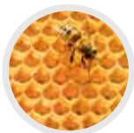
beeswax / cera alba