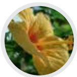
hibiscus / hibiscus sabdariffa