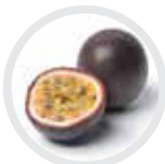
maracuja / passiflora edulis