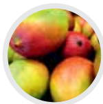
mango / mangifera indica