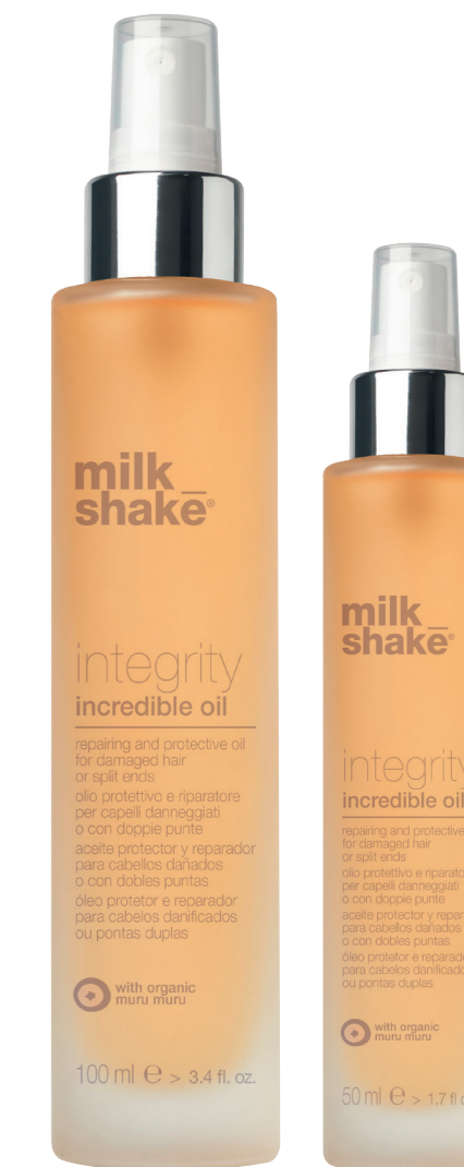
Available in 100 ml and 50 ml formats.