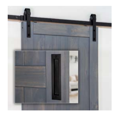
Kit with Flush Pull $240