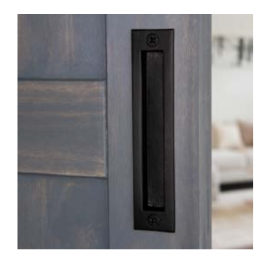
Flush Pull $65