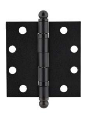
4.5" HEAVY DUTY Square Corner Hinges $17