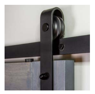
Track & Rollers $185