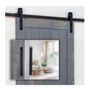
Kit with Flush Pull & Grip $340