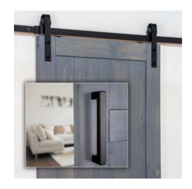
Kit with Grip $285