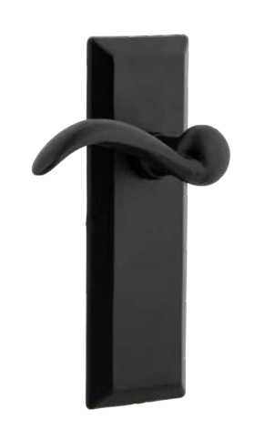
Keep Plate, Tine Lever (KEPTIN)