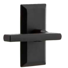
Vale Plate, Dirk Lever (VALDRK)