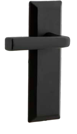
Keep Plate, Lance Lever (KEPLAN)