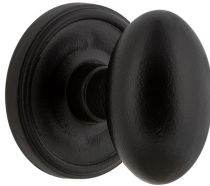
Aeg Knob on Loch Rosette

> Material: Cast iron, zinc plated and powder coated