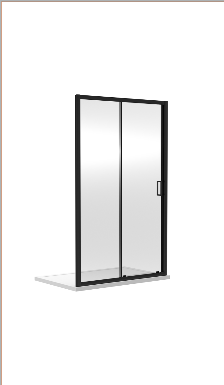
SQ Slider Enclosure

Description: 1000X1850mm Sliding Shower Door